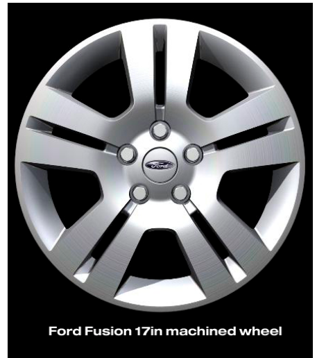
Ford Fusion 17in machined wheel