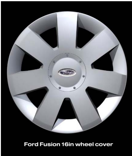
Ford Fusion 16in wheel cover

16" Steel Wheel w/Deluxe Wheel Cover Standard on S